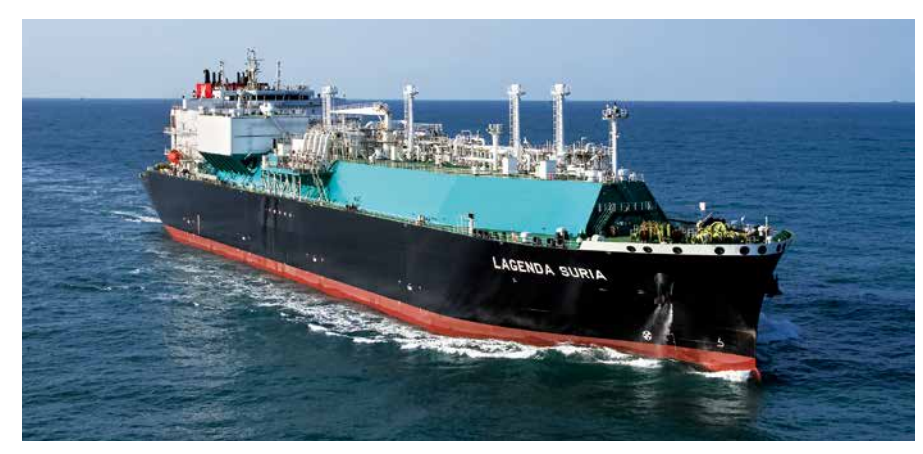
W-Max LNG carrier Lagenda Suria to be chartered to PETRONAS

for underground CO<sub>2</sub> storage in Malaysia, and will examine the possibility of collecting and transporting CO<sub>2</sub> from the LNG terminal in Bintulu, as well as the possibility of accepting