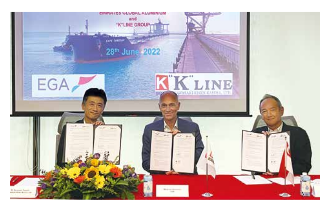
The signing ceremony for the MOU with EGA for a joint study on decarbonization

Since Dubai Aluminium, the predecessor of EGA, was founded in 1979, "K" Line has been engaged in transporting raw materials for the company. It has initiated a long-term bauxite transportation contract with Capesize bulker for hauling 5 million tons of bauxite per year starting in 2019.