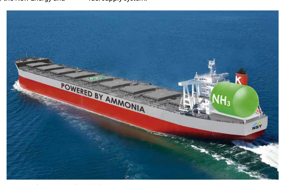
An image of the ammonia-fueled bulk carrier

In the project, Mitsui E&S will supply the world's first model of the ME-LGIA ammonia-fueled engine developed by German engine builder MAN Energy Solutions, along with ammonia fuel tanks and the propulsion systems, including the fuel supply system.