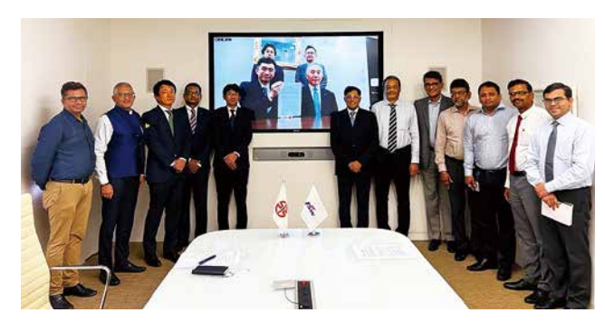
The online signing ceremony for "K" Line's MOU with JSW Steel for a joint study on decarbonization

In 2008, "K" Line's dry bulk carrier division transferred part of its operation functions to a local subsidiary established with a partner in India, and also entered the local coastal operator business. In 2014, "K" Line established its subsidiary "K" Line (India) Shipping Private Limited (KLISP) to bolster its business in India by stepping up the possession of Indian-flagged vessels.