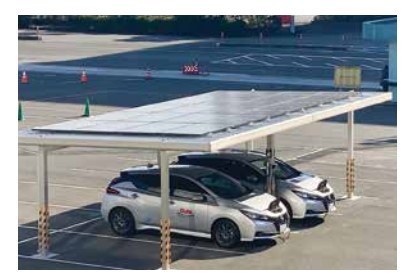
Solar carport/EV is introduced to Daikoku C4 Terminal