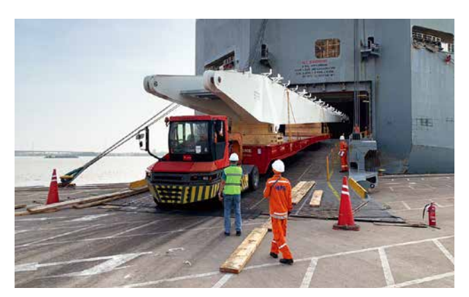
Loading scene of a crane jib

"K" Line caters to transportation demand for not only construction machinery but also other non-self-propelled cargo items such as railway cars, machine tools, power transformer/generator equipment, oil well pipes, belt conveyors and cable drums. Some of its customers bring out-of-gauge (breakbulk) cargo items, which are not sufficiently large in terms of either size or volume to be put on general cargo ships but which are also not suitable for containerships. The Company can offer competitive solutions for these cargo in terms of schedule punctuality and stability, service quality and cost. It accepts these items and puts them in its PCCs with roll-on/roll-off