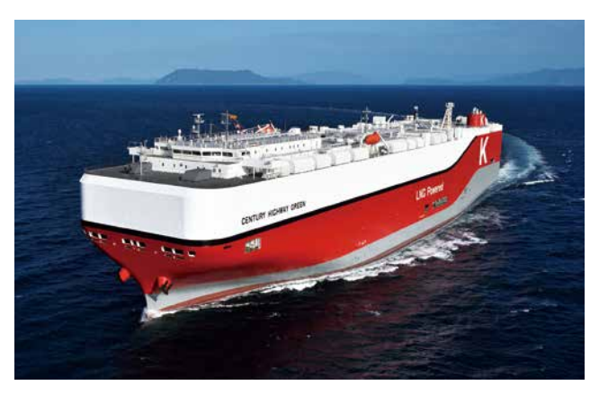
Century Highway Green, the first LNG-fueled PCC to be operated by the "K" Line group

FY2023 and FY2025 and agreed to have two each built at Nihon Shipyard Co. Shin Kurushima Dockyard Co. and China's Merchants Jinling Shipyard (Nanjing) Co. The six vessels have been ordered for the Company's own possession. Two of them, ordered from Nihon Shipyard, will be built at Imabari Shipbuilding. The remaining two vessels, to be chartered from third parties, are due to be completed in the second half of FY2023.