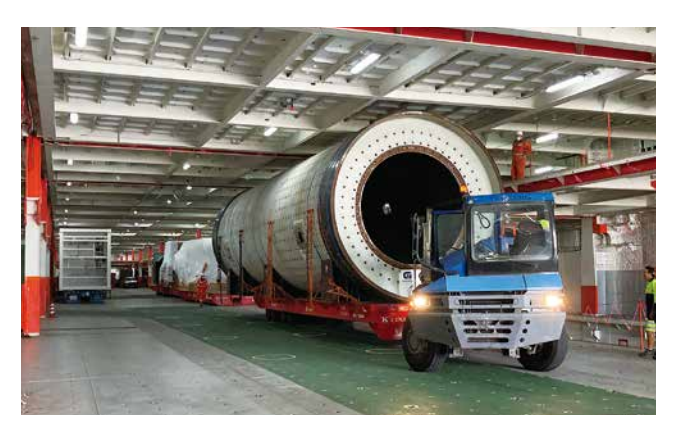
A loading operation for an ultra-large mill drum

holding in-depth talks with customers and providing them with detailed service proposals.