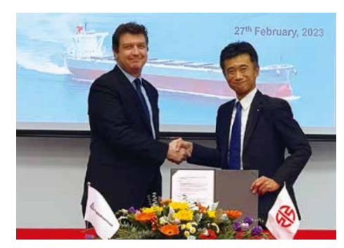
The signing ceremony with Anglo American

The collaboration is part of "K" Line's efforts to expand stable earnings while meeting new demand triggered by low carbon and decarbonization. It will continue to strengthen the partnership between the two companies to contribute to reducing GHG emissions and decarbonizing society.