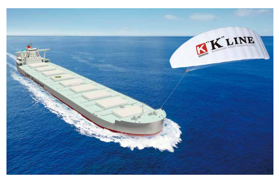
An image of a ship with Seawing